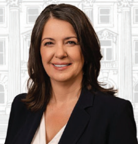
Honourable Danielle Smith, Premier of Alberta

A blue ink signature of Danielle Smith, written in a cursive style.